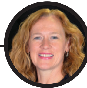
Commission Vice Chair