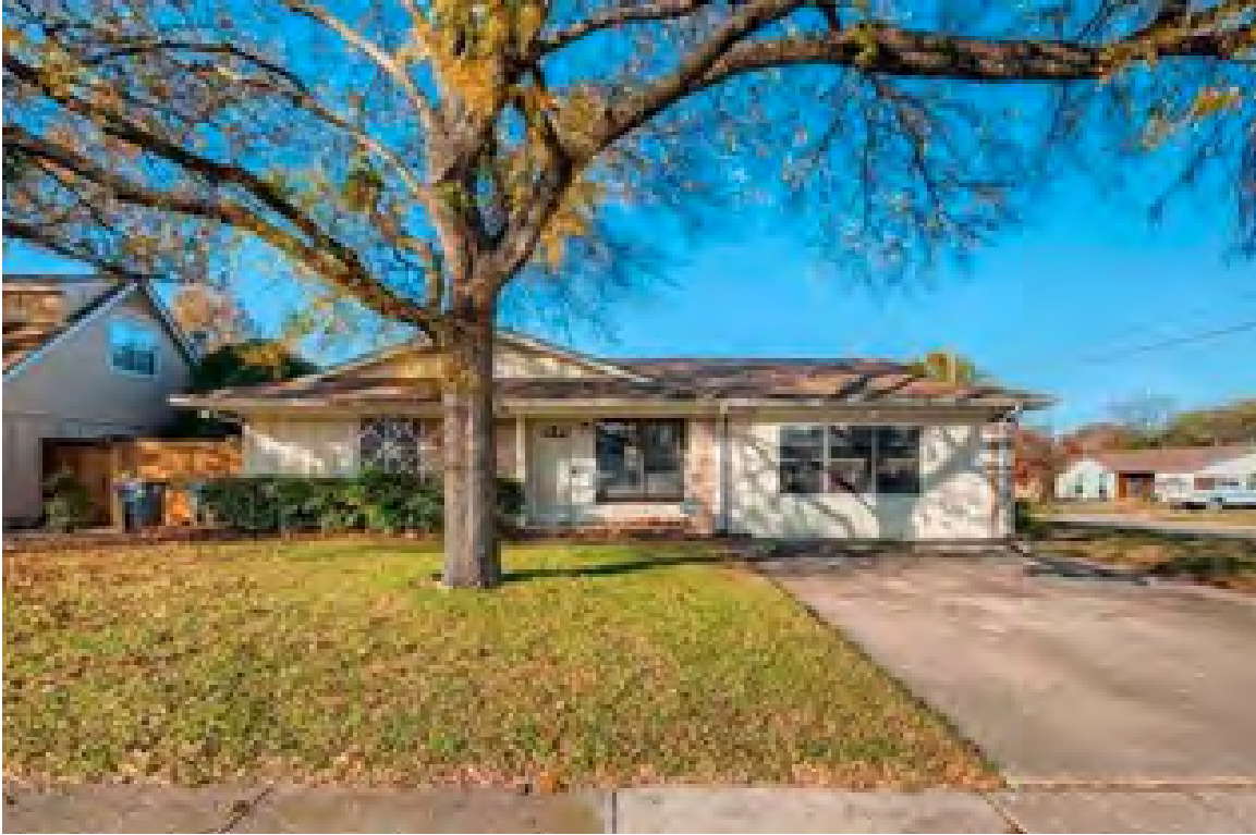
EXAMPLE: Front façade of Housing for Texas Heroes project