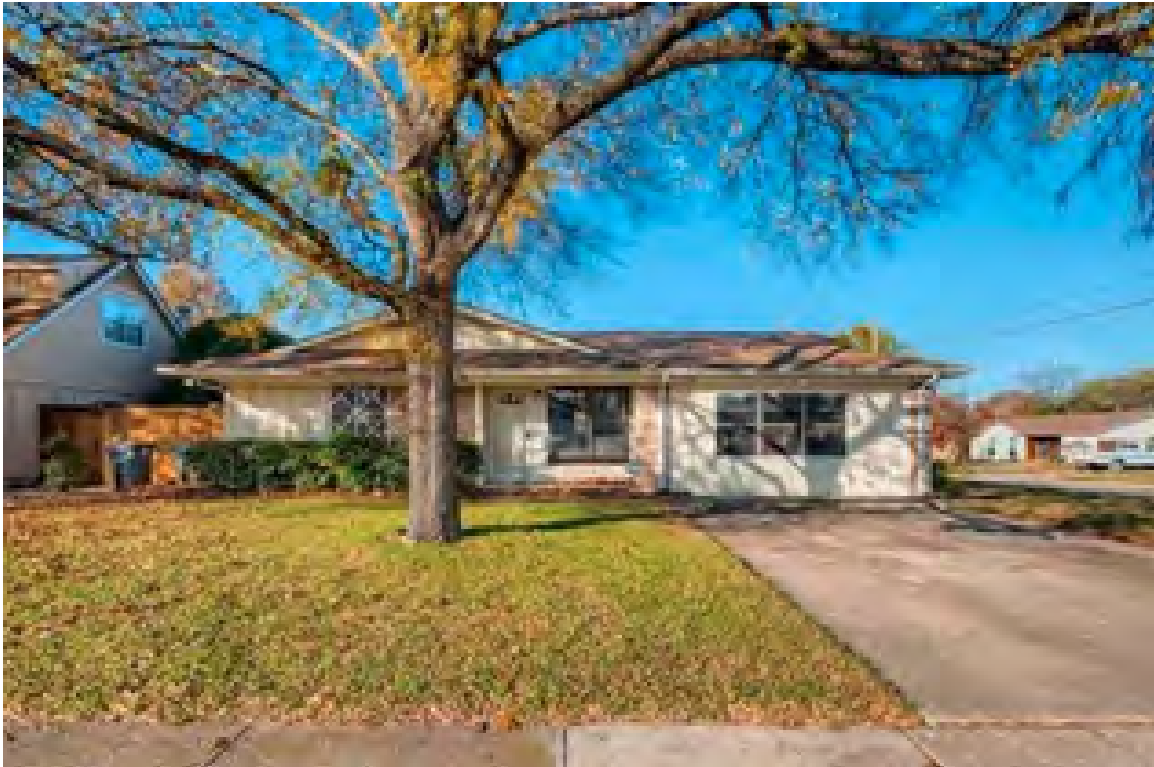
EXAMPLE: Front façade of Housing for Texas Heroes project