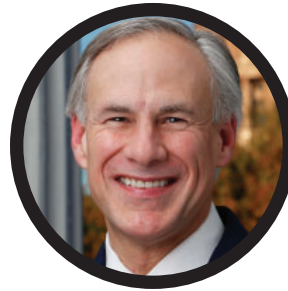
Governor Greg Abbott